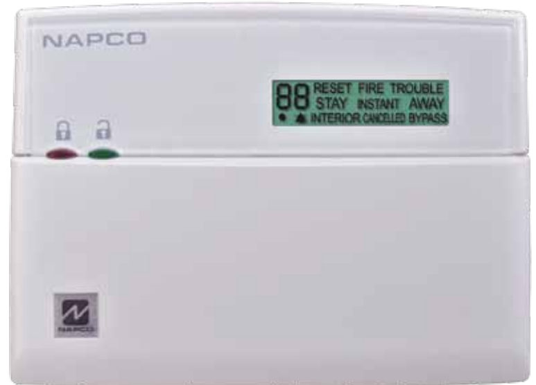
LIB-DXK432RF-4UK Keypad, above, with built-in RF receiver, (available in 319 and 433 MHz)